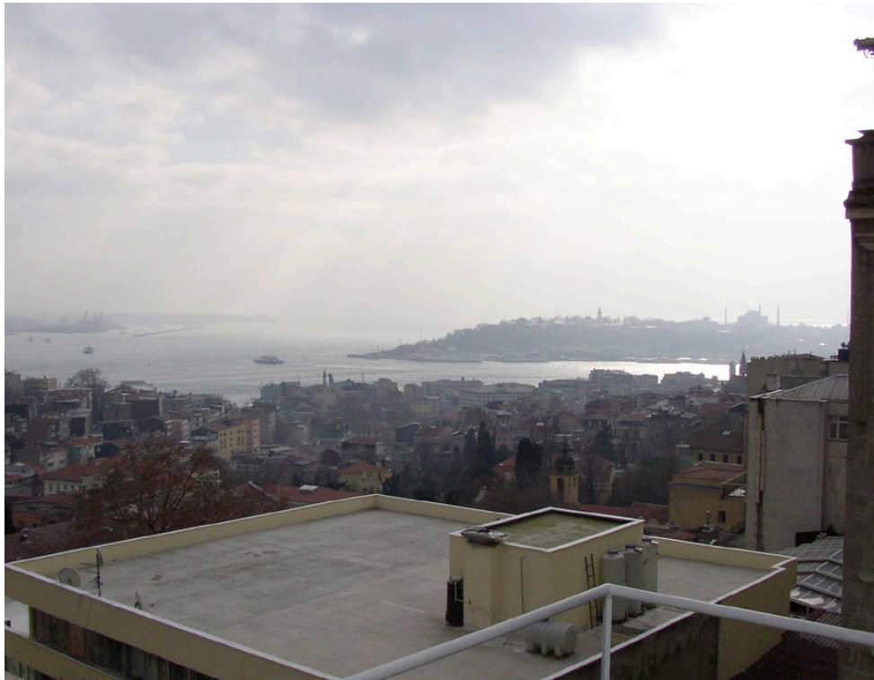
Room from the Penthouse