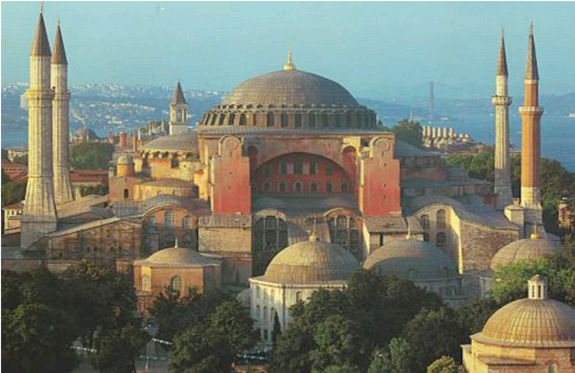
Ayasofya Museum, Istanbul